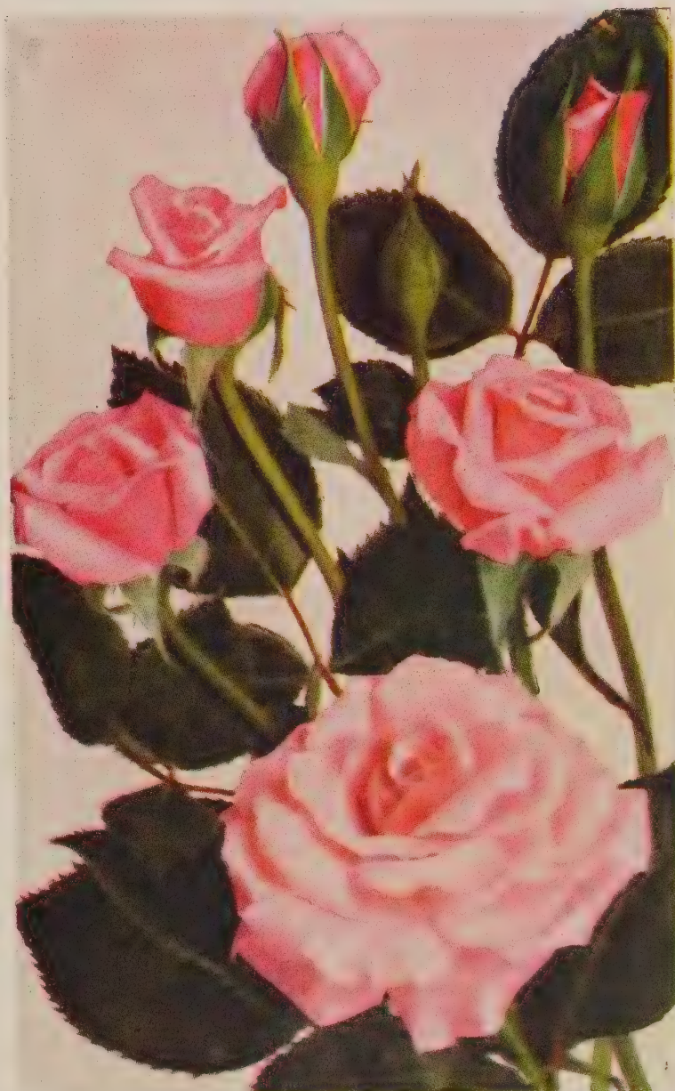
ROSE ELFE—$1.00 each; 3 for $2.50

PINOCCHIO —Plant Patent No. 484. Extremely hardy, very easy to grow, always in bloom, with hundreds of flowers on every bush. Pointed buds are rich salmon, blushed with gold at base, gradually changing to soft clear pink as the flowers open. $1.25 each, 3 for $3.15.